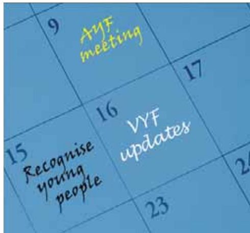
2008: the year that was. Where will we be in 2009?

A decade on, this government's decision to establish the Australian Youth Forum, and importantly, to re-fund Australia's national youth affairs peak, represents not merely the realisation of an election promise, but also a recognition of the rights of young people to be heard on issues that matter to them, a response to the overwhelming support of the youth sector for greater sector development and a stronger voice in their government, and, most importantly, a genuine commitment to engaging meaningfully with young Australians in a variety of ways that are independent, accountable and inclusive. (October 2008)