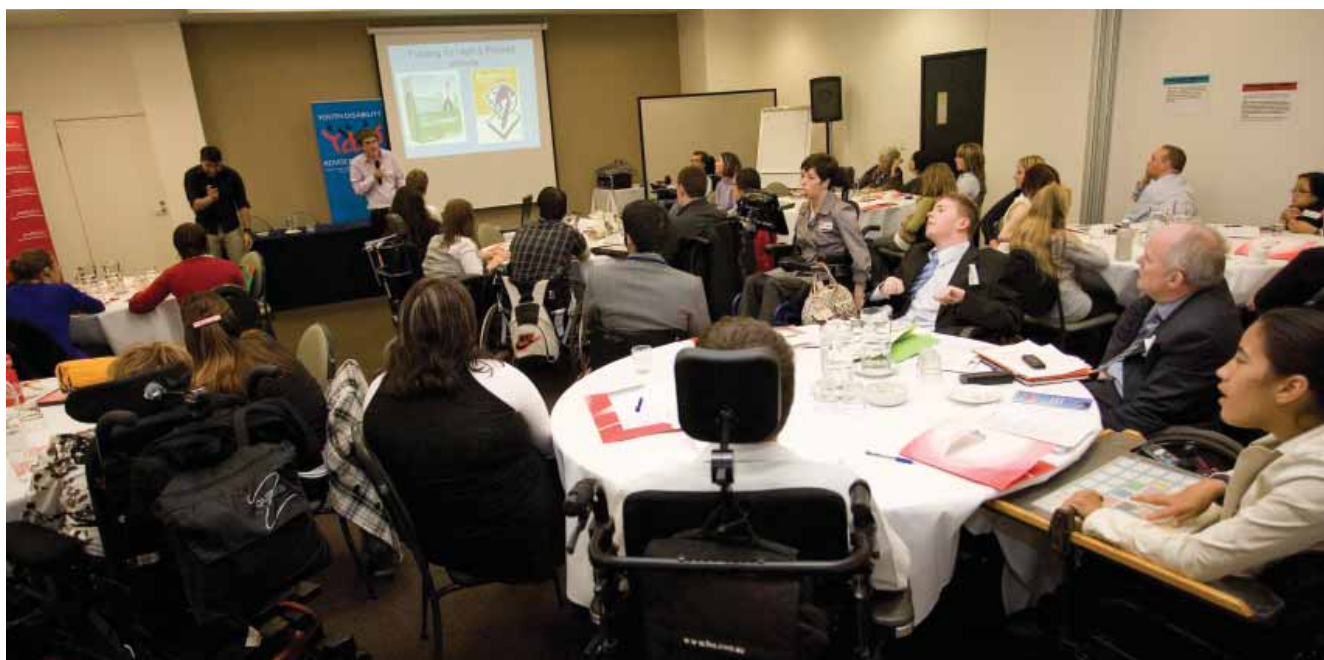
Below: The Roundtable venue at the Jasper Hotel, Melbourne