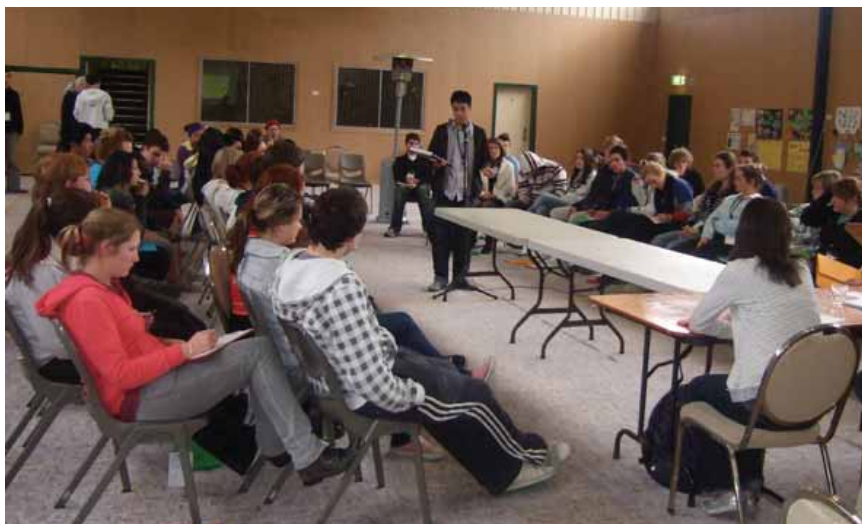
Discussion and debate at the Congress

Each workshop brought one or more proposals to be debated in a formal parliamentary Congress setting. Delegates didn't necessarily agree on everything but conducted the debates with integrity and respect for each other's viewpoints. The issues were many and varied and demonstrated the range of issues important to students. Everything from healthy food to rural disadvantage to environmental sustainability was passionately debated. Significantly several resolutions called on government for greater support and training for SRCs and SRC teachers. These are being given high priority by the newly elected Student Executive charged with implementing the Congress Resolutions. I was fortunate to be elected at Congress as one of the new executive members of this thriving group. I am excited to be part of the Executive and to now start planning to implement all the great decisions that we made.